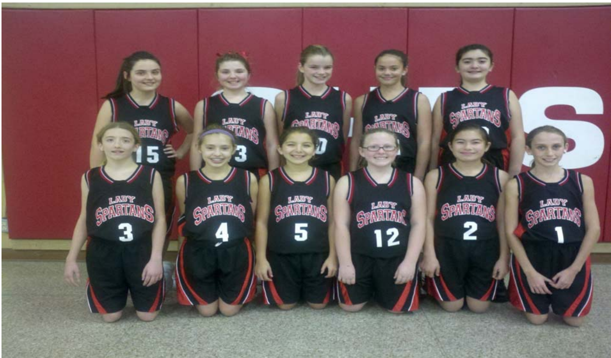
Thank You the Men's Club for their generous donation to the athletic department for the purchase of new basketball uniforms.